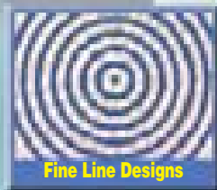
Fine Line Designs