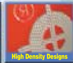
High Density Designs