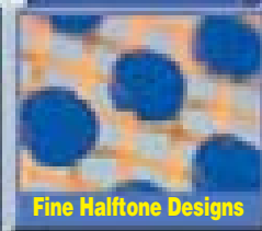
Fine Halftone Designs