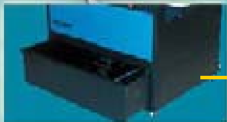
Easy Access Maintenance.